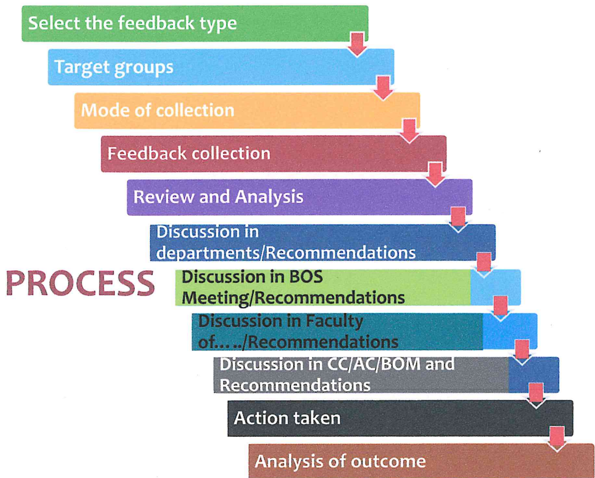
Fig.1: Feedback process